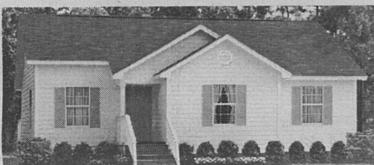
The Chadwick, just one of more than 30 home designs you can choose to build on your property.

Visit us today, or if it's more convenient, give us a call and we'll come to you! Call 1-800-4WALTER ext 60 for a free brochure or log onto our web site: www.jimwalterhomes.com